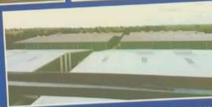
SCOPE OF WORK: PMC - Powder Plant Building and Raw Materials Godowns, Civil and PEB works, AREA : 18000 sft, VALUE : 340 lakhs