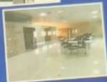
SCOPE OF WORK: Civil, Puff Panel, Plumbing, Road Work and Developments, AREA : 52000 sft, VALUE : 430 lakhs