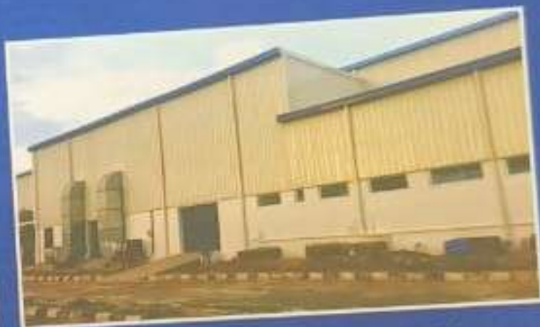
SCOPE OF WORK: RCC G+1 Admin Buildings, PEB Sheds, Retaining Walls 22 Acres, AREA : 8500 sft, VALUE : 470 lakhs