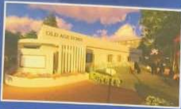
SCOPE OF WORK: Old Age Home Construction Civil and Plumbing Works, External Developments Works AREA : 8500 sqft VALUE : 280 lakhs